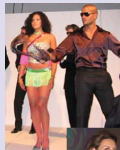
More than 300 guests danced the night away at the pARTy.